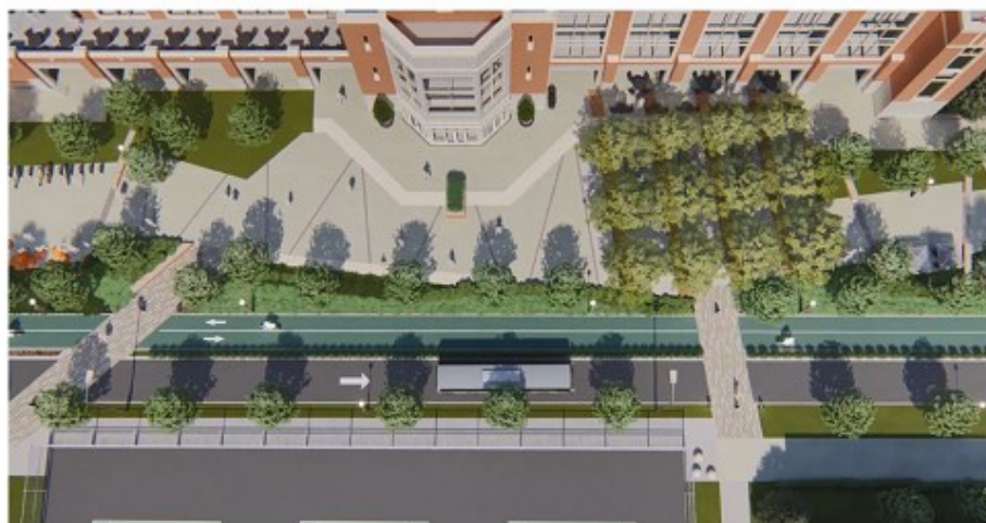
Dining Hall Plaza

Pedestrian Walkway Phase II creates, a safer and more pedestrian friendly central campus, new bike lanes, and additional relaxing gathering spaces.