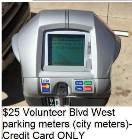
$25 Volunteer Blvd West parking meters (city meters)-Credit Card ONLY