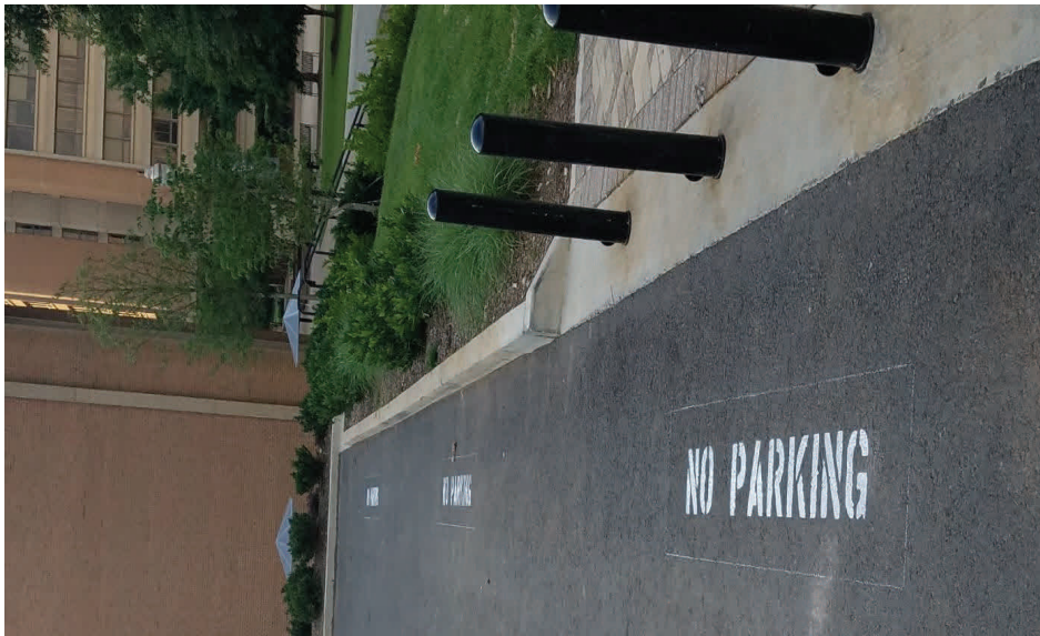
NEW NO Parking area in Staff 9 at Art and Architecture for improved safety and traffic flow